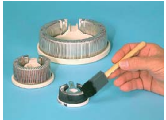
Cerama-Dip™ 538N-BLK coats rheostats.

GC4000 Glass-enamel, gloss-black coating for stainless steel to 1000 °F (538 °C).