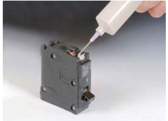
Ceramacoat™ 512-N insulates circuit breaker screw.